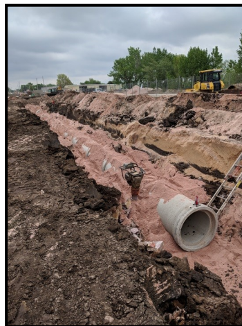
30" storm drainage pipe installed on Madison Street