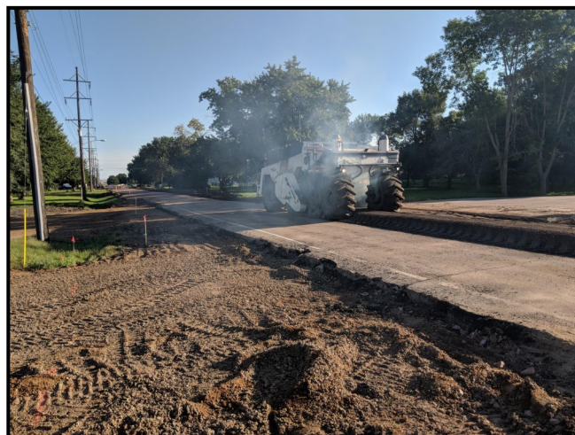
Reclaim machine grinding the existing asphalt pavement to be used as the base for the new roadway