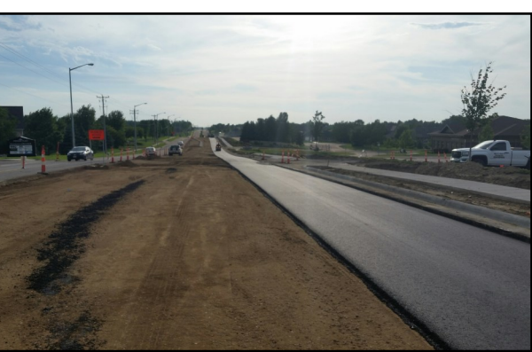
69th Street, looking west, with asphalt pavement placed on the gravel base during the asphalt paving operation