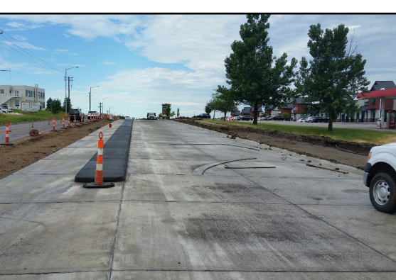
69th Street, looking west near the 69th Street and Western Avenue intersection, with concrete pavement and the median complete.